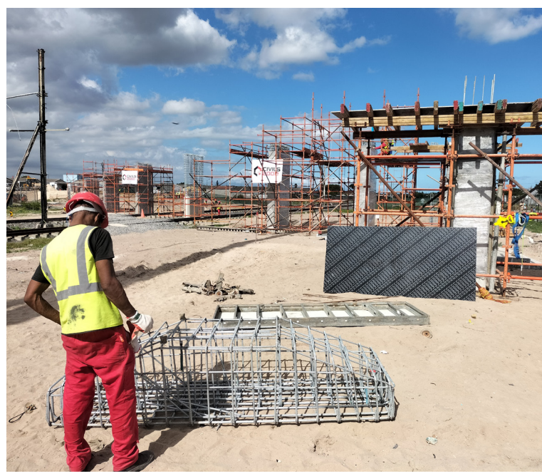
Construction of the pedestrian bridge is planned until December 2023.

Meanwhile. Community Liaison Officers have been appointed for both affected wards (75 and 76) and a project engagement committee has also been established to represent the community and work closely with the project management team and councillors.