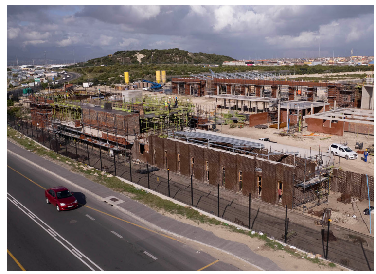
The project is 12% complete and on track to be finished by March 2025.

Temporary job and sub-contracting opportunities are still available for locals registered on the City's Jobseekers' Database.