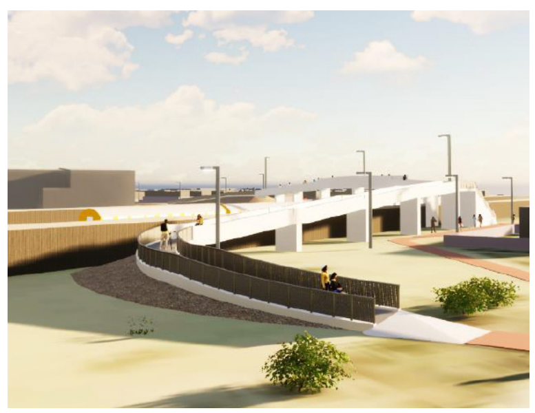
The pedestrian bridge is planned to be ready for use in November.

Upcoming work includes screeding the bridge deck, installing fencing, commissioning street lights and the planned CCTV surveillance for added safety.