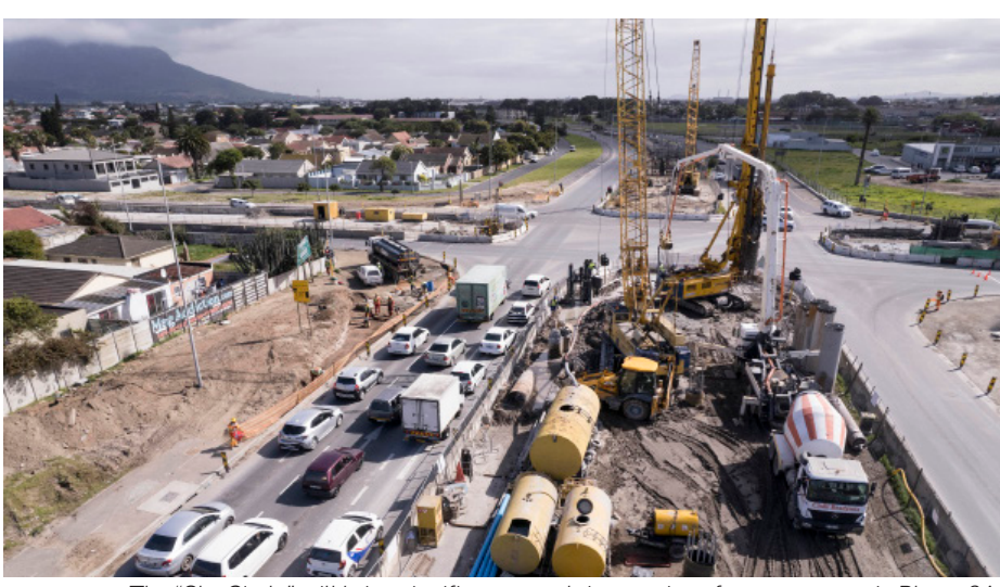
The "Sky Circle" will bring significant travel time savings for commuters in Phase 2A.

Traffic diversions at the intersection are ongoing in order to accommodate work to widen the entire westbound carriageway of Govan Mbeki Road, from Heinz Road to Strandfontein