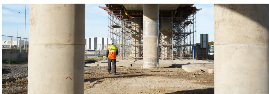
The elevated traffic circle is planned to be complete by late 2026.

Motorists are urged to factor in extra travel time and to follow the signage in place to help keep everyone safe.