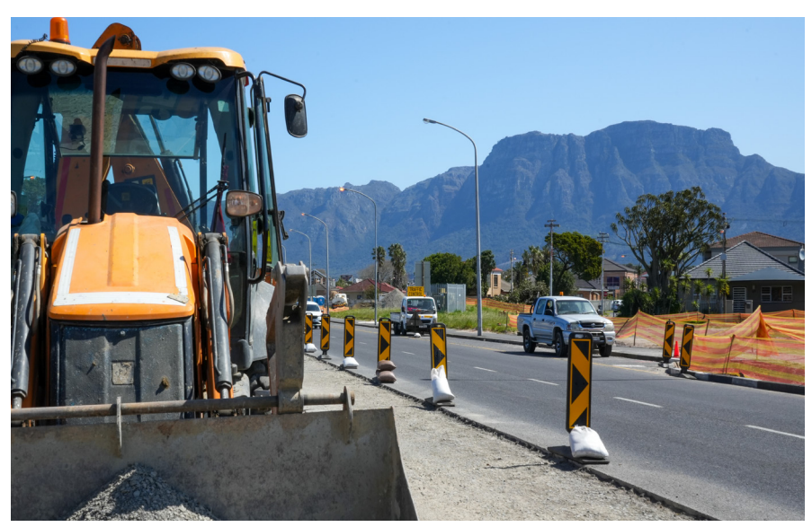
Motorists are urged to comply with the reduced speed limit of 40km/hour.

The project is scheduled for completion by June 2027.