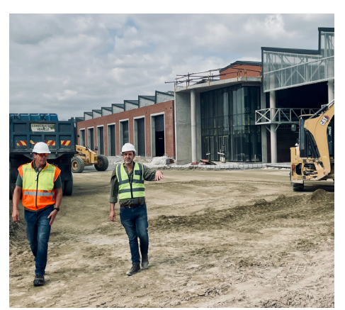
The side-by-side depots will be at the heart of Phase 2A operations.

The construction of two bus depots at the intersection of Spine Road and Mew Way is nearly 80% complete.